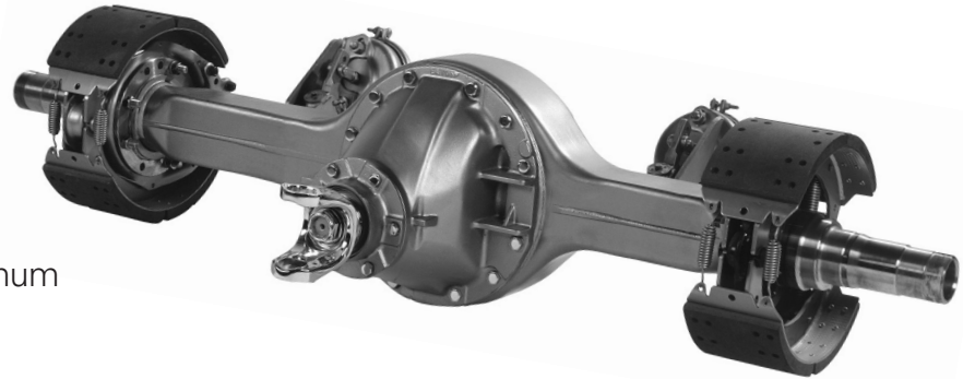
Spicer® 21060 Single Reduction Single Axle