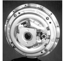
Stamped Angle Spring® (Pull Type)